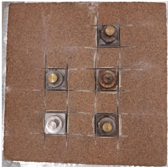
Figure 6. The concrete slab before measuring the bond strength.

Steel Pull-head plates (square, side 50 mm) were glued to the coating on 7.5.2020. The test was performed on 8.5.2020 (Figure 6 and Figure 7) with Baustoff-Prüfsysteme F15D Easy M2000.