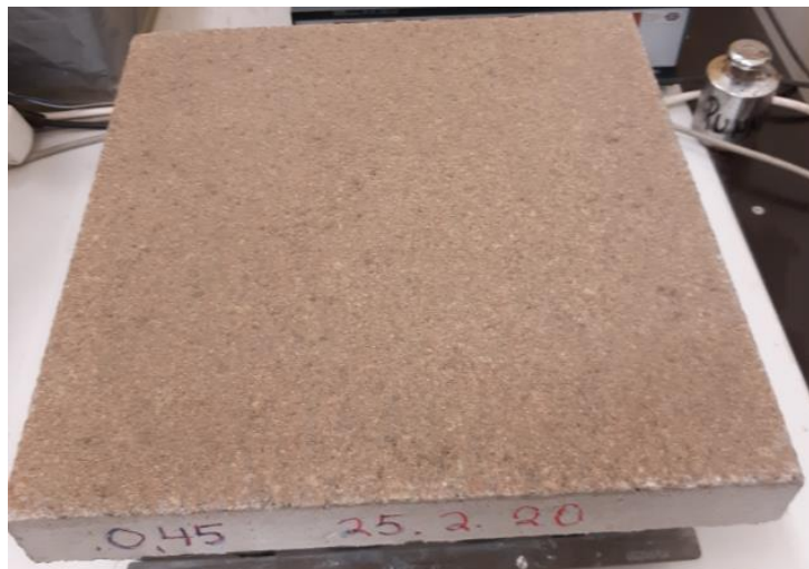
Figure 2. The concrete slab after vacuuming the sand.

Test results are only valid for tested sample(s). This report may be published in its entirety, parts of it only with a written permission by Eurofins.