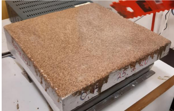
Figure 3. The concrete slab after coating of Ambienta Magic Part 1, 2 and Cork granules.