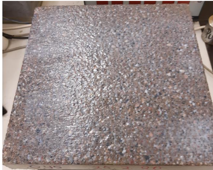
Figure 1. The concrete slab after priming.