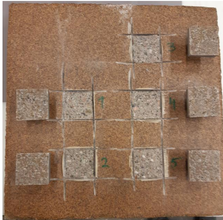
Figure 7. The test specimens after test.