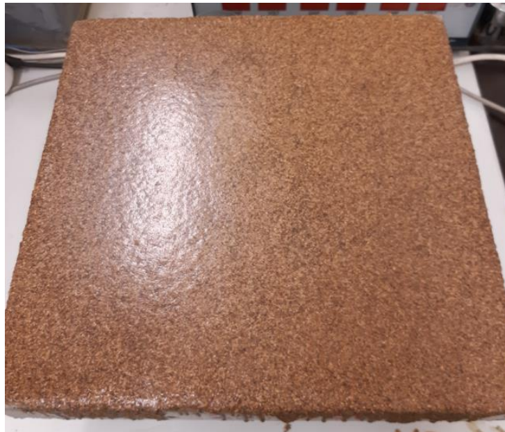
Figure 4. The concrete slab before coating of Ambienta Magic Finish Part 1 and Part 2.

Test results are only valid for tested sample(s). This report may be published in its entirety, parts of it only with a written permission by Eurofins.